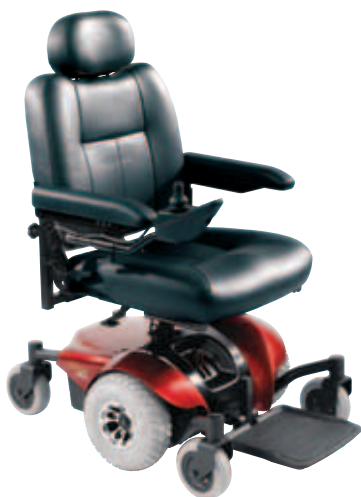
Pronto® M41™ with Semi-Recline Van Seat (optional)