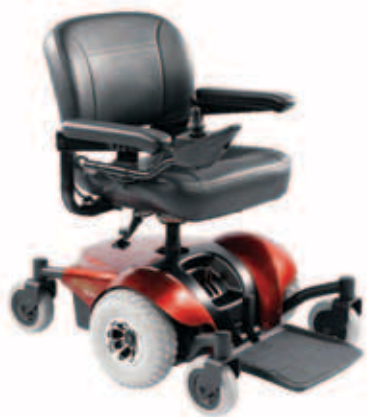
Pronto® M41™ with Fold-Down Seat (Standard)

The Invacare® Pronto® M41™ is the latest offering in the sleek and versatile Pronto® series of Power wheelchairs. The M41™ features the latest technology in electronics and in-line motors. This combination provides increased efficiency, battery range and an increased top speed. The M41™ also features a center wheel drive platform, simplified SureStep®, and six wheels on the ground providing stability and maneuverability similar to other Pronto® models. All of these features are packed into a simple, clean-looking, and easy-to-service compact frame that provides mobility with style for people on the go!