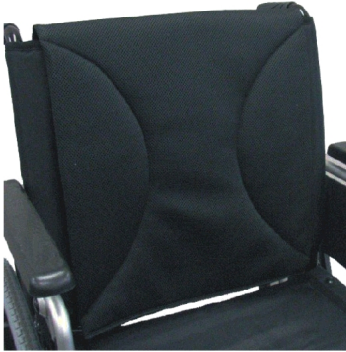
Front view of Back Assembly