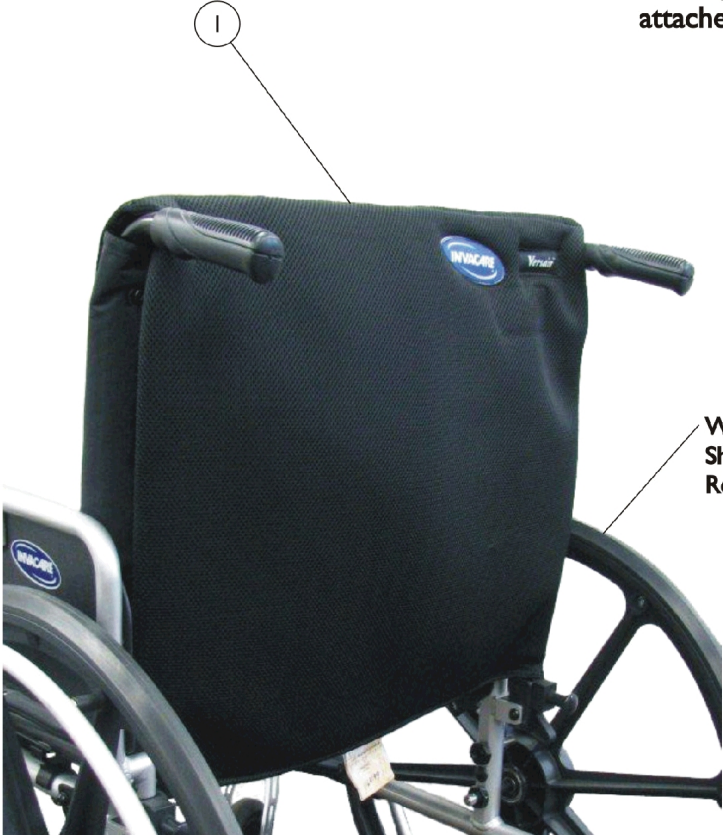
Wheelchair Shown for Reference only