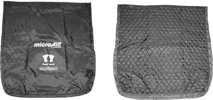
MicroAIR Mattress Covers