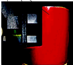
Left Rear Top View (Shim spacer is not required in this view)