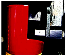
Right Rear Top View (rack is out of alignment and shim spacer is required)