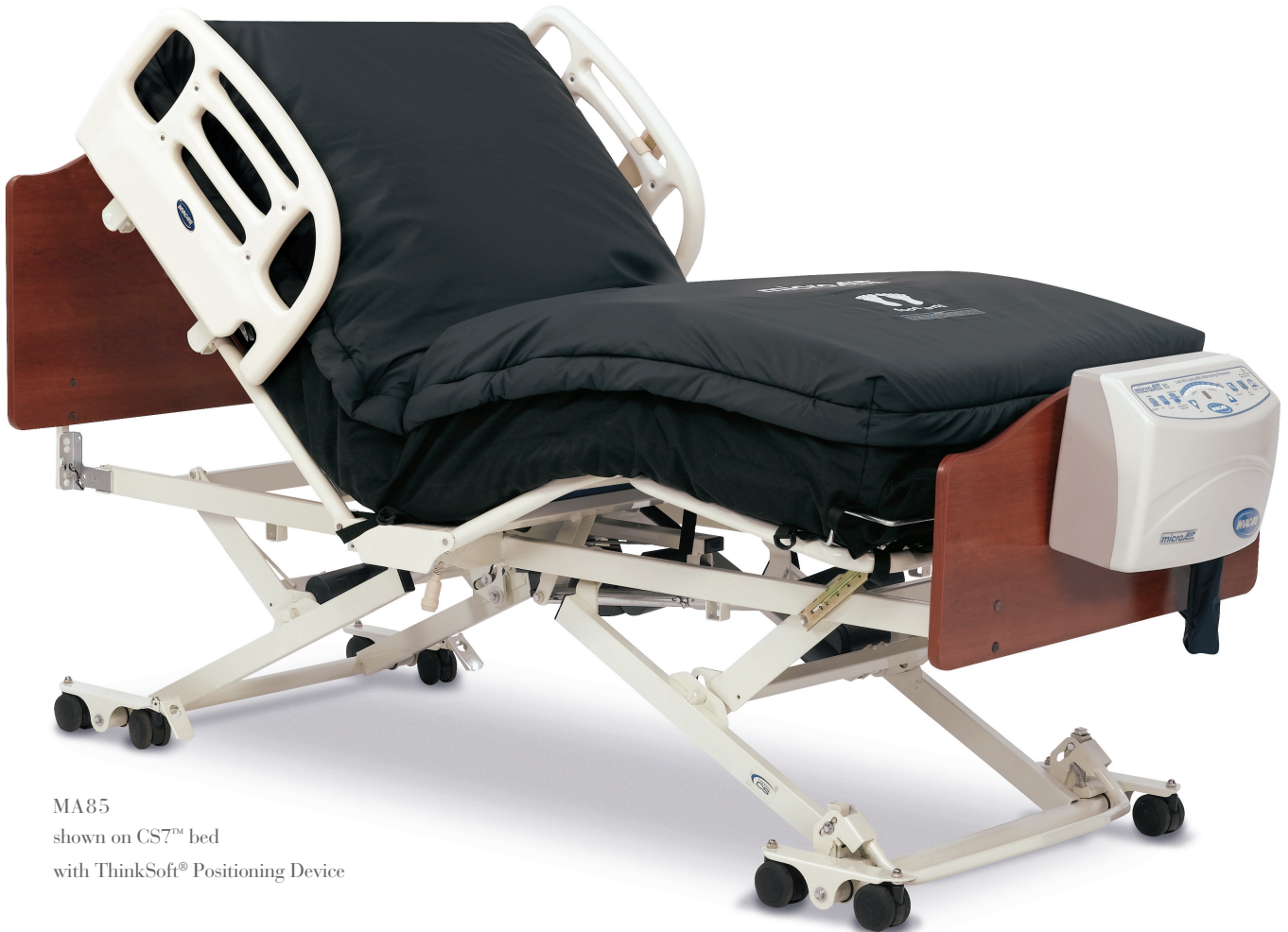
MA85 shown on CS7™ bed with ThinkSoft® Positioning Device

These two (2) true low air loss mattress models help manage skin moisture to avoid maceration and maintain a dryer environment for healing pressure ulcers in the treatment of Stage I to Stage IV pressure ulcers.