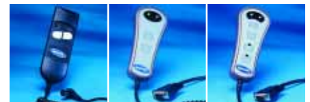
Hand pendant for Two- and Three-Way Lift Chairs