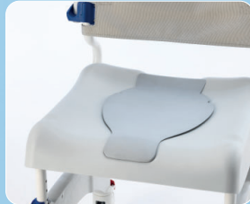
Soft seat insert