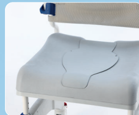
Small soft seat insert