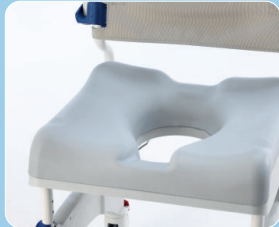
Standard soft seat