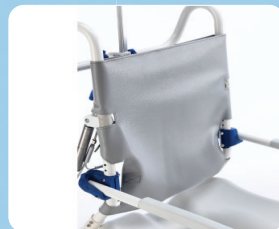
Comfort soft backrest