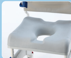
Small soft seat