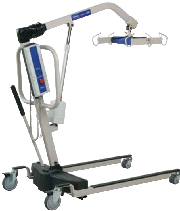
RPL600-1: Powered with low base