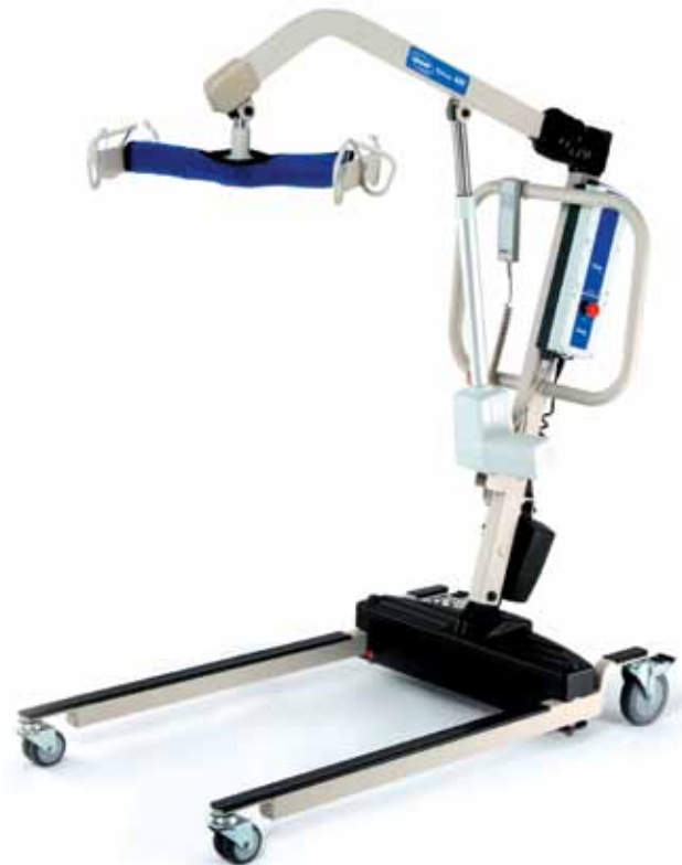
RPL600-2: Powered with power opening low base