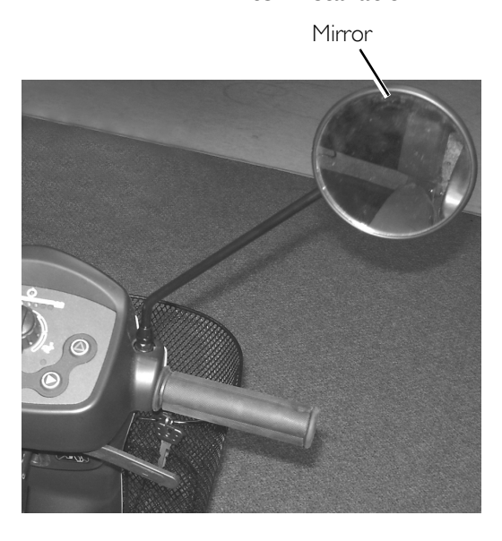
FIGURE I Using the Mirror