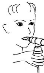
FIGURE 2.2 Using the Nebulizer