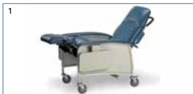
1. Full recline position

Two convenient side tables for holding prep materials Footrests fold completely under chair, allowing the patient to rise to a standing position more easily Blow-molded side panels remove quickly, with press pins, for easy cleaning Gas cylinder for instant Trendelenberg positioning for shock patients Articulating headrest joins patient to social field of vision Flame retardant upholstery – meets California Technical Bulletin 117 standard