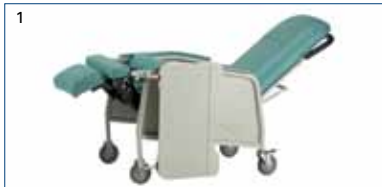
1. Full recline position

Footrests fold completely under chair, allowing the patient to rise to a standing position more easily Blow-molded side panels remove quickly, with press pins, for easy cleaning Convenient overlap tray included. Tabs allow tray to move freely Articulating headrest joins patient to social field of vision Flame retardant upholstery – meets California Technical Bulletin 117 standard