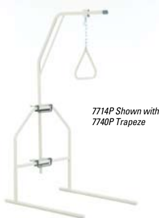
7714P Shown with 7740P Trapeze